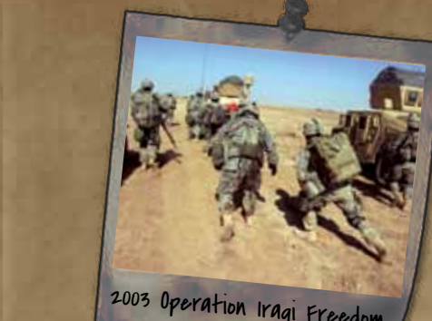
2003 Operation Iraqi Freedom

2011 DLA CELEBRATES 50TH ANNIVERSARY SUPPORTING WARFIGHTERS