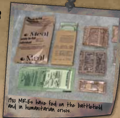
150 MREs have fed on the battlefield and in humanitarian crisis

Defense Contract Administration Services Region Los Angeles is responsible for NASA's design, property and quality assurance of the Apollo-Soyuz space project - the first joint flight of the U.S. and Soviet space programs DSA RENAMED DEFENSE LOGISTICS AGENCY (DLA)